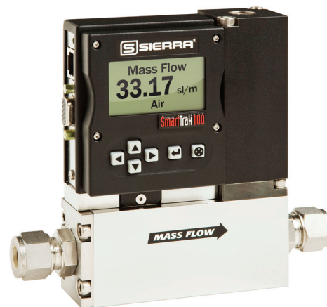
Figure 2: SmartTrak® 100 Digital Mass Flow Controller

Glass manufacturing process engineers, for example, are always seeking methods to improve glass quality, reduce raw material waste, and increase production capacity. They require a constant burner temperature at all times to produce the perfect quality glass. If too much natural gas is fed into the burner, the flame will be too hot and the glass will melt.